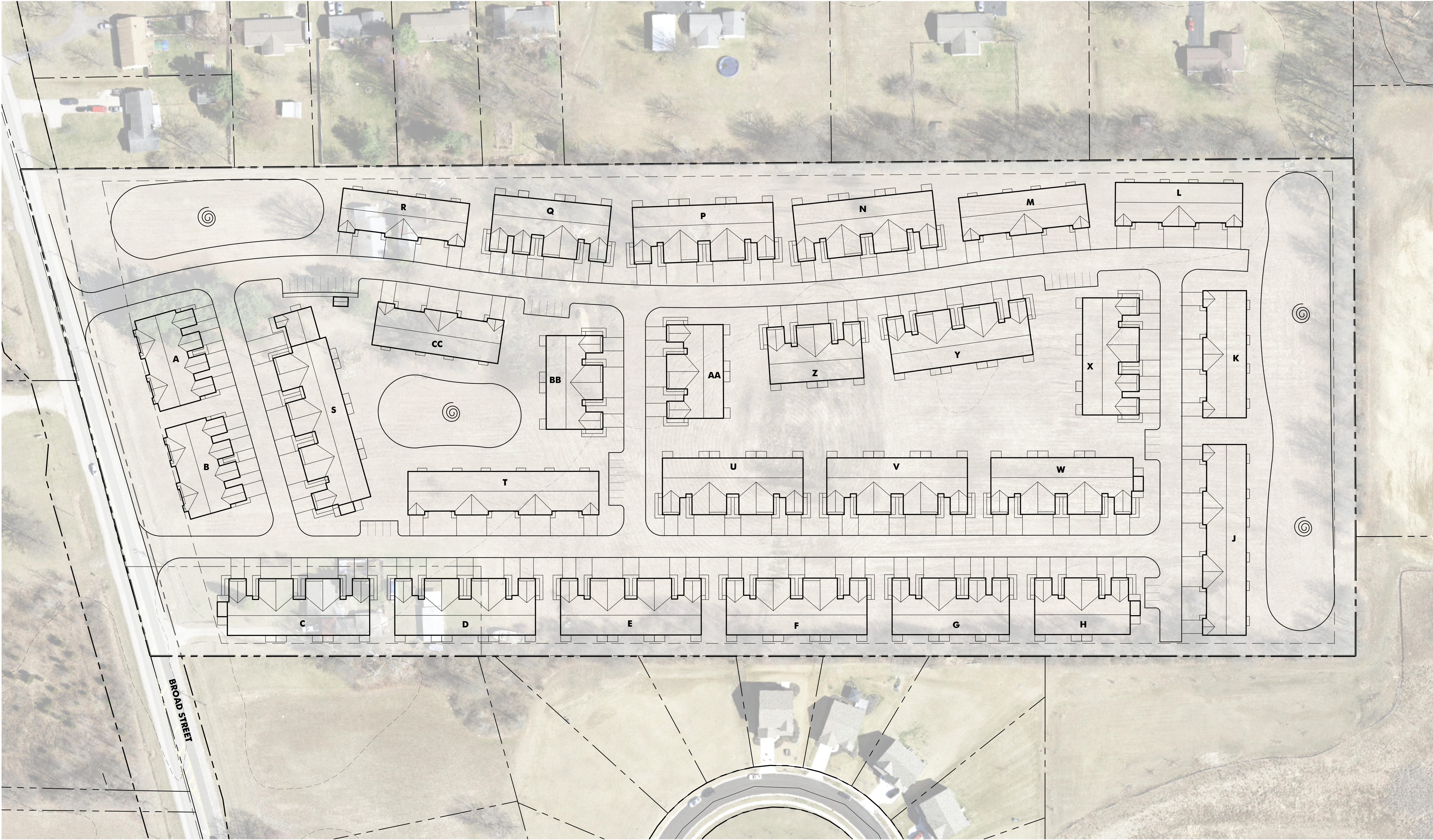
Preliminary Concept Plan SCALE: 1" = 60'