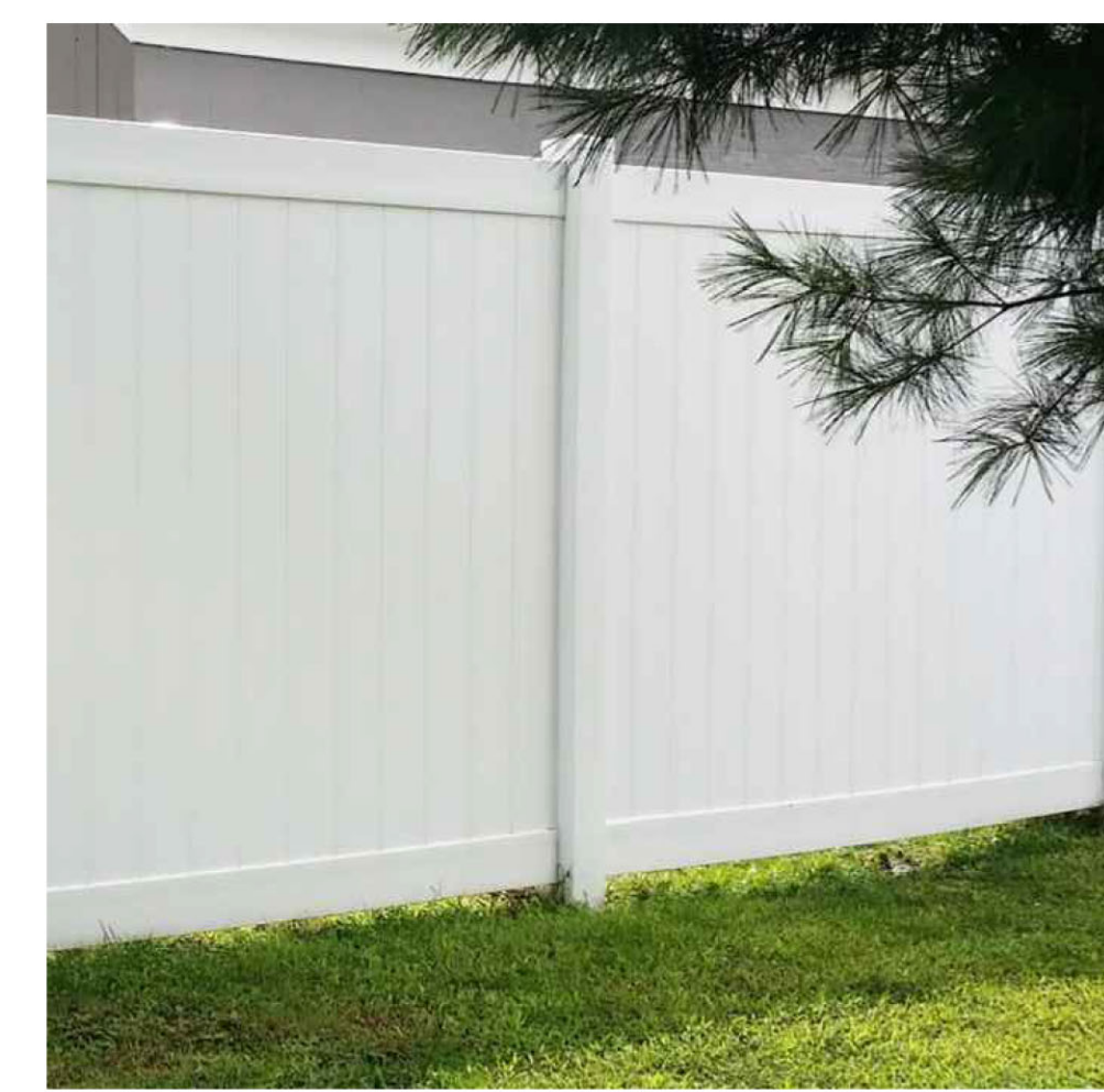
*OR OWNER APPROVED EQUAL