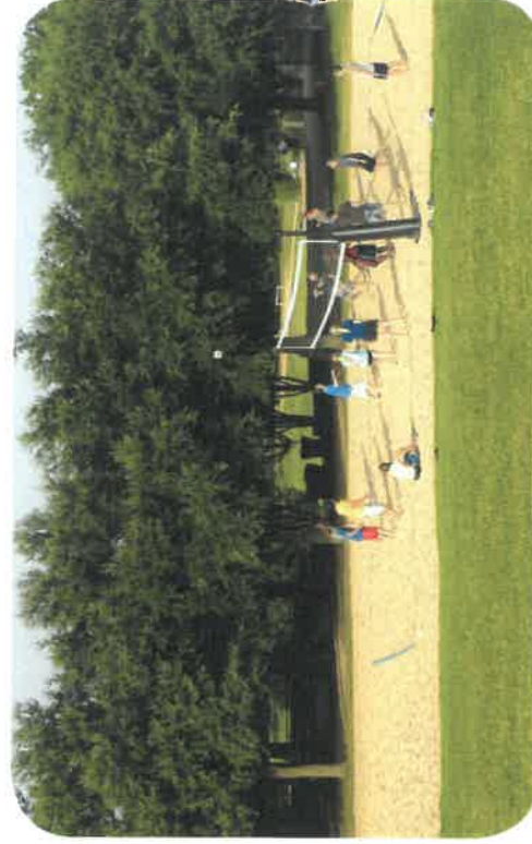
ENHANCED VOLLEYBALL COURT