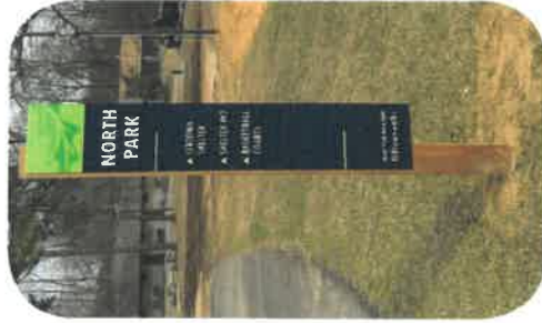
DIRECTIONAL WAYFINDING SIGN