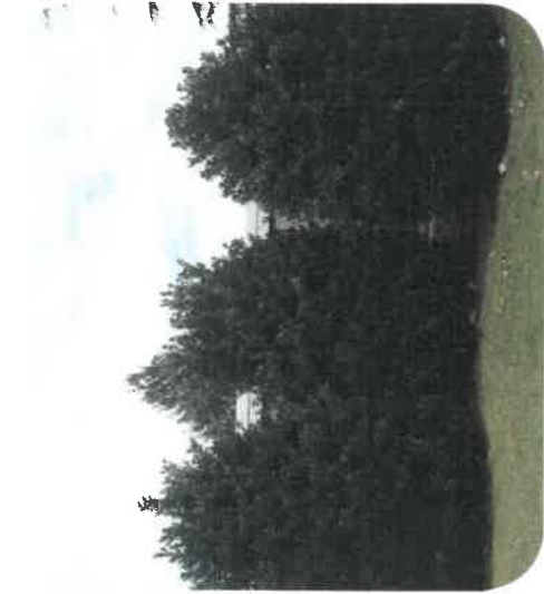
ADDITIONAL SCREENING KARR PARK CHARACTER IMAGES